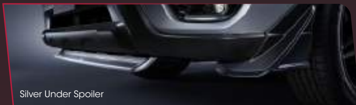
Silver Under Spoiler

Mounted on either ends of the front bumper, this spoiler aids in improving stability by regulating the air-flow coming from the front/sides and diverting it to the rear – this also prevents lift.