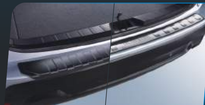
Cargo Step Panel

Protect the cargo area floor from scratches, scuffs, dirt and moisture with a durable, heavy duty cargo tray that has been customized to fit the Forester's cargo area for ease of removal and cleaning.