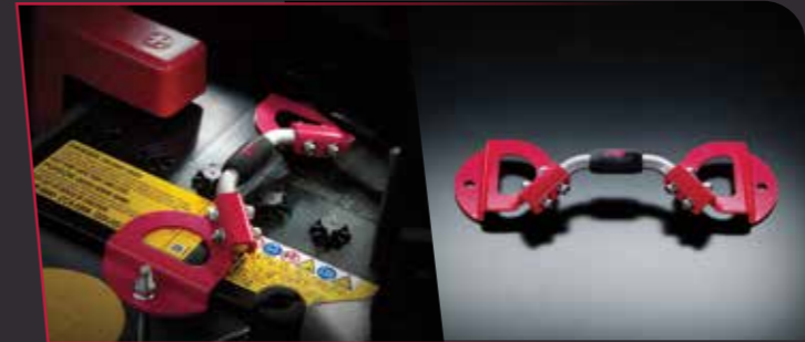
STI Battery Tower Bar $150 ST82182ST000

A unique battery holder reminiscent of the flexible tower bar, adds an attractive highlight to the engine compartment, in addition to securely holding the bulky battery.