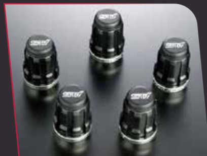
STI Wheel Nut Black Set (20 Pcs) $300 ST28170ST020

These wheel valve caps are lightweight with a knurled finish design on machined aluminium to prevent slippage. A silver alumite treatment has been applied to the surfaces of these valve caps to improve its resistance to weather and match the color of the aluminium wheels. The hexagonal heads of the valve caps have rounded tops, and a cherry red STI logo is stamped on the embossed area.