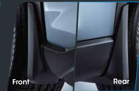
Splash Guard (2 Pcs) $107 J1010SJ001 $107 J1010SJ004

This offers added protection to the lower bumper area while giving it a stylish, rugged accent.