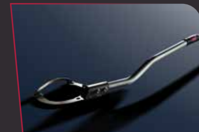
STI Flexible Tower Bar $589 E4010FL000

This is an oil filter with enhanced performance thanks to an increased filtration area of 15% compared to conventional filters. With dedicated materials to improve its particle collection performance, this filter also captures fine particles such as carbon and reduces pressure loss by 10%. It is compatible with high viscosity oil, providing a stable performance not only on roads but also on the circuit track.