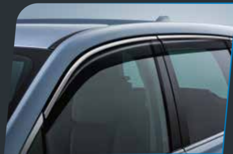
Door Visor With Chrome Molding (2 Pcs) $236 F0010SJ010

It provides good air circulation and keeps the rain out when driving with the windows down.