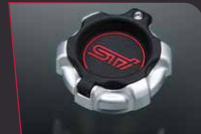
STI Engine Oil Filler Cap $161 ST15257ZR010

*Compatible with batteries with "D" as the third digit