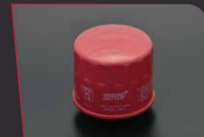
Performance Oil Filter $75 ST15208ST010

This is an oil filter with enhanced performance thanks to an increased filtration area of 15% compared to conventional filters. With dedicated materials to improve its particle collection performance, this filter also captures fine particles such as carbon and reduces pressure loss by 10%. It is compatible with high viscosity oil, providing a stable performance not only on roads but also on the circuit track.