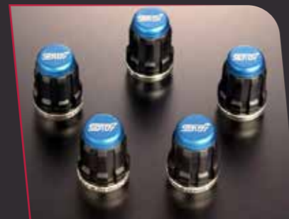
STI Wheel Nut Blue Set (20 Pcs) $300 ST28170ST000