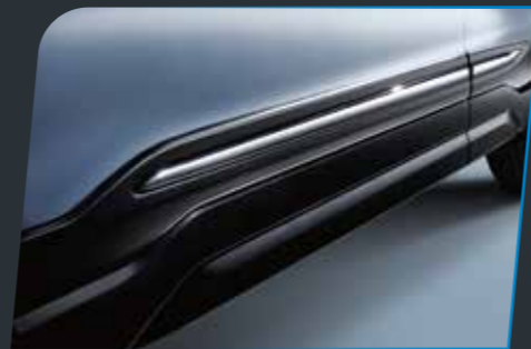
Body Side Molding (2 Pcs) $1284 J1017SJ150

It provides good air circulation and keeps the rain out when driving with the windows down.