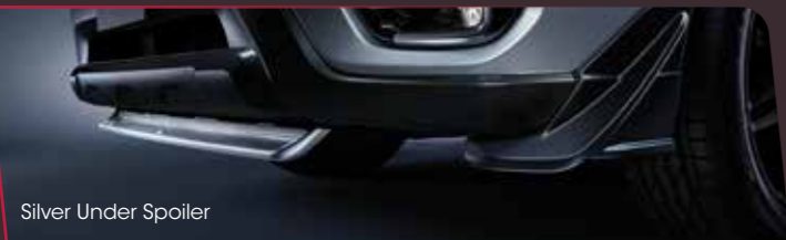
Silver Under Spoiler

This spoiler rectifies the flow of air from the front to the sides of the vehicle and improves driving stability. It controls the flow of air and prevents it from lifting the vehicle by diverting it towards the rear.