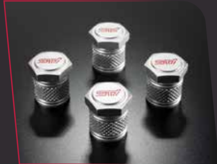
STI Valve Cap Set (4 Pcs) $81 ST28102ST030

These wheel valve caps are lightweight with a knurled finish design on machined aluminium to prevent slippage. A silver alumite treatment has been applied to the surfaces of these valve caps to improve its resistance to weather and match the color of the aluminium wheels. The hexagonal heads of the valve caps have rounded tops, and a cherry red STI logo is stamped on the embossed area.