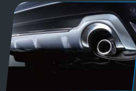
Rear Bumper Under Guard (Bumper Panel) $856 E5510SJ000

Without proper air flowing into the engine compartment, a car is at risk of overheating. The chrome front grille plays an important role in cooling the vehicle's engine, specifically the radiator. It also lends a distinctive style to the vehicle.