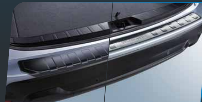
Cargo Step Panel

Protect the cargo area floor from scratches, scuffs, dirt, and moisture with a durable, heavy duty cargo tray. This tray has raised edges to contain spills and messes. It is also custom fit to the Forester's cargo area for ease of removal and cleaning.