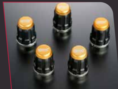
STI Wheel Nut Gold Set (20 Pcs) $300 ST28170ST010

Narrow lug nut set with 3-piece structure. This product has a 3-layer coating, dichromate finishing to protect against corrosion on tapered areas. Its caps have a clear-coated, laser-engraved STI logo. The theft prevention lock nut can only be installed/removed with a special tool.