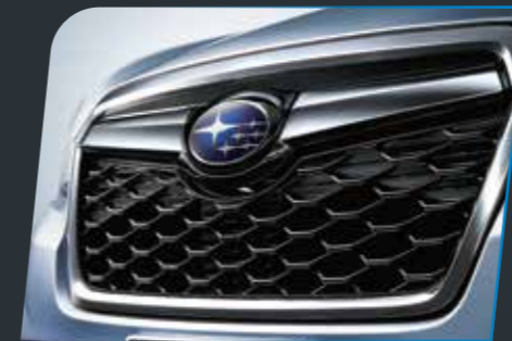
Chrome Front Grille (For Premium Grade) $642 J1010SJ100

This easy-to-install body side molding is designed to protect the Forester from shopping carts, door dings, scratches and other road hazards. The colours are matched precisely for added style.