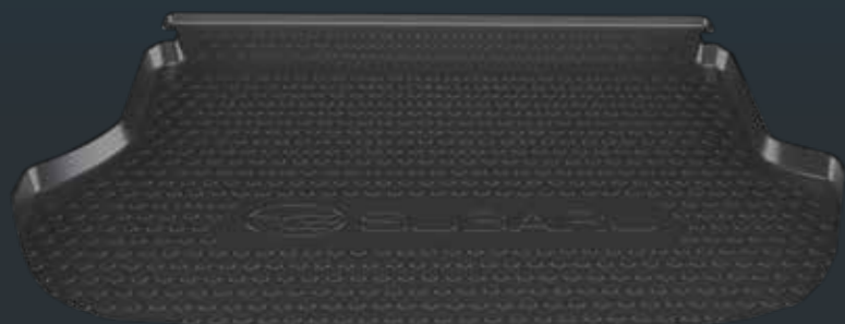
Cargo Tray Low $225 J501ESJ000

Protect the cargo area floor from scratches, scuffs, dirt, and moisture with a durable, heavy duty cargo tray. This tray has raised edges to contain spills and messes. It is also custom fit to the Forester's cargo area for ease of removal and cleaning.